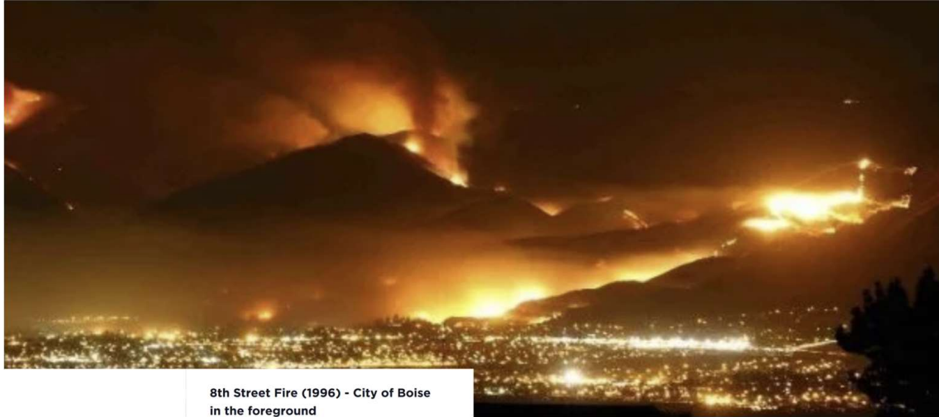
8th Street Fire (1996) - City of Boise in the foreground

Wildfire season is coming! Each of us has an important role to play in protecting our property and community from wildfire.